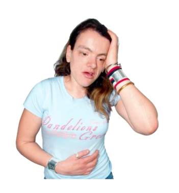
I am allergic to Write it here: