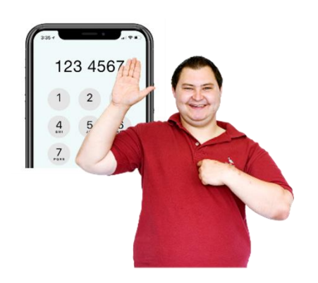
My phone number Write it here: